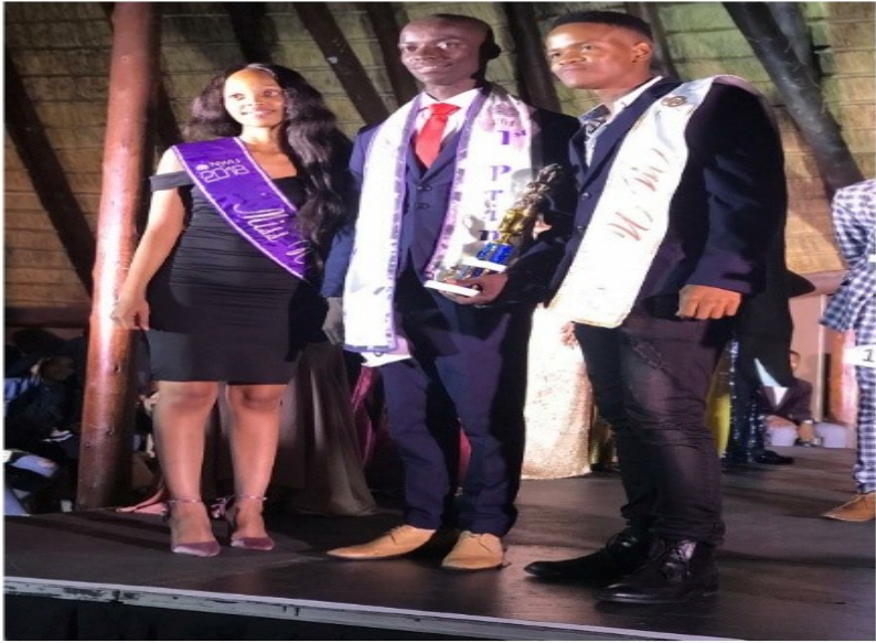
Mr and Mrs NWU VAAL